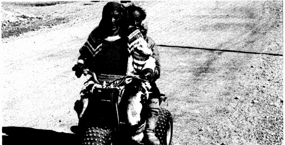
The old order changeth...! (H. Finsten)