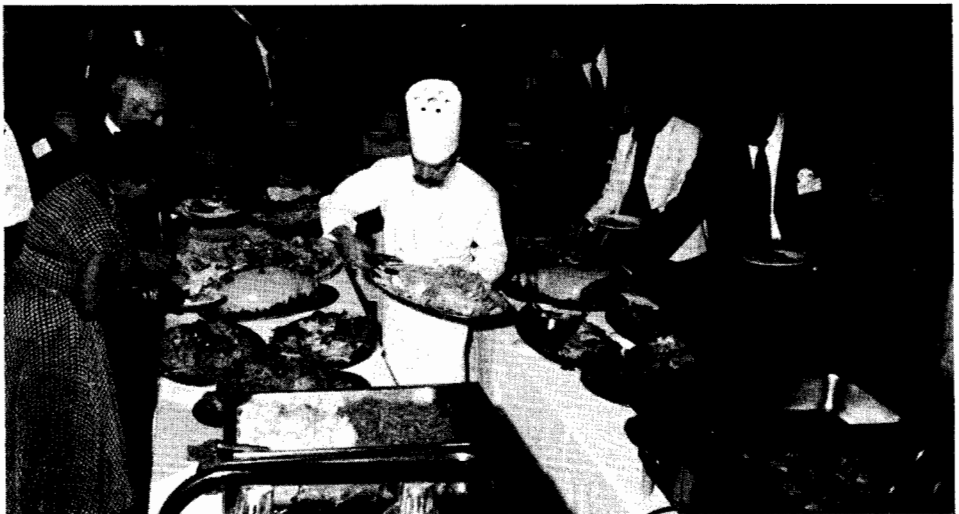
The conference wound up with a supper dance Friday night.