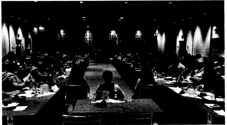
Formal business sessions were held in the Yellowknife hotel where the Legislative Assembly holds its sessions.