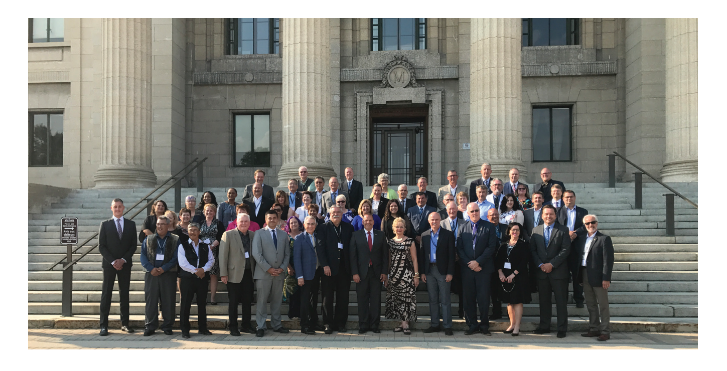
Some delegates of the 55<sup>th</sup> Annual CPA Canadian Regional Conference pose on the steps of the Manitoba Legislature during a break from the proceedings.

grants for a legacy project that will keep building and fostering the networks that were created, and another DOTV event is planned for 2020.