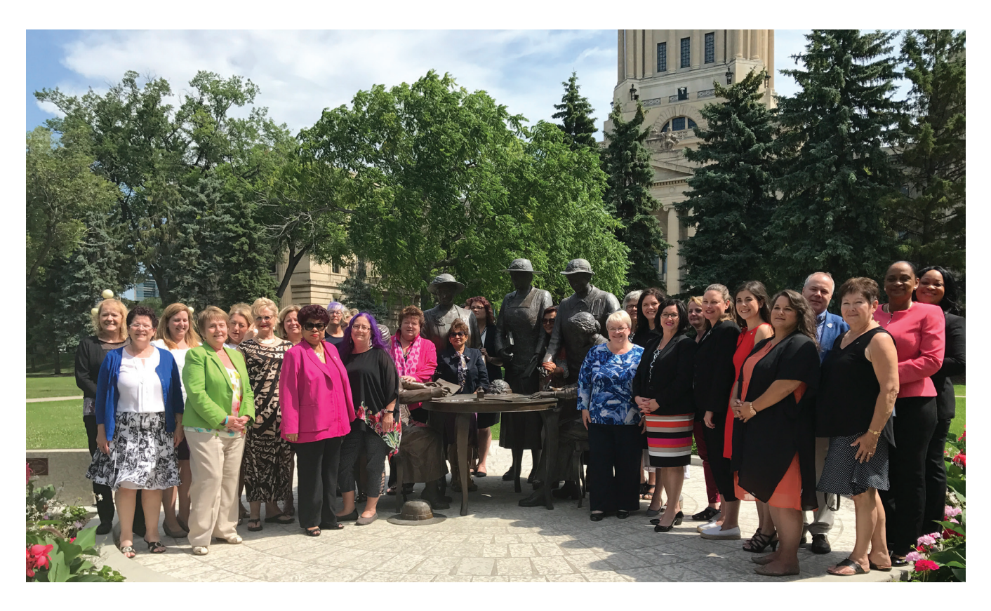
Canadian Women Parliamentarians delegates gather around a statute of the Famous Five located on the grounds of the Manitoba legislature in honour of Nellie McClung's accomplishments as a suffragist.

mainland portion of the province and was honoured to share this accomplishment with all of Labrador.