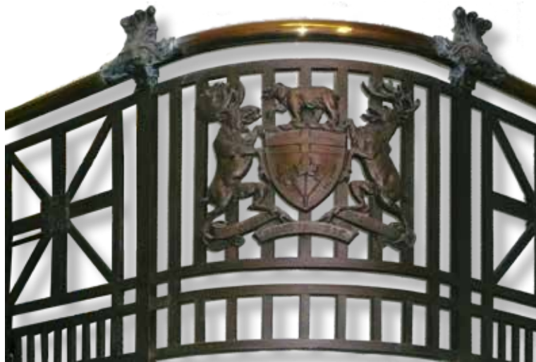
Fragment of the Library's ironwork with the provincial crest.

Besides adopting new technologies for existing services, the Ontario Legislative Library has also introduced additional services over time. The Camp Commission, an all-party commission chaired by Dalton Camp in the 1970s, studied the functioning of the Library and how it could be improved. Among the recommendations made in the Commission's 1973 report and implemented within a few years was to create a research service and to restrict the Library's services to the Legislature. Until then, the Library had served the entire provincial government as well as the general public. The Legislative Research Service was established in 1979 to provide research and analysis to members and legislative committees. In 1986, the Library started Toronto Press Today (TPT), an early morning clipping service covering the three daily Toronto newspapers. While the Library also provides Ontario-wide news clippings via e-mail subscriptions, the printed copies of TPT continue to be a staple for members and staffers at Queen's Park.