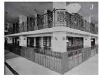
1912 to present