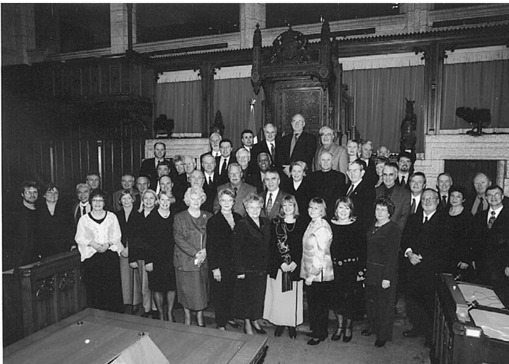
Delegates and Observers at the 21st Conference of Canadian Presiding Officers in Ottawa

The Canadian Presiding Officers Conference was timed to coincide with the 17th Commonwealth Speakers and Presiding Officers Conference which took place from January 9-12, 2004. Following adjournment of the Canadian Conference all the Presiding Officers were transported to Montebello for the