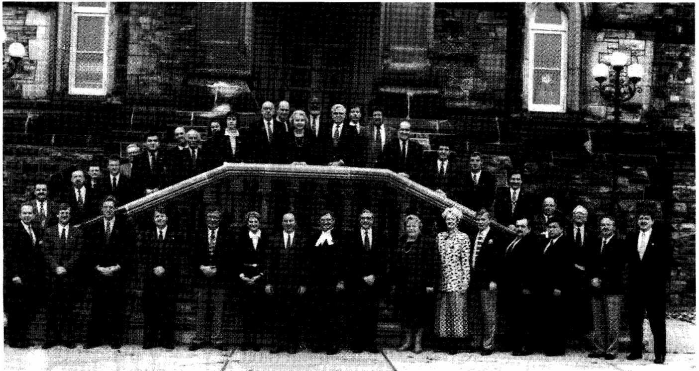
Delegates and observers at the 18th Canadian Regional Parliamentary Seminar in Ottawa