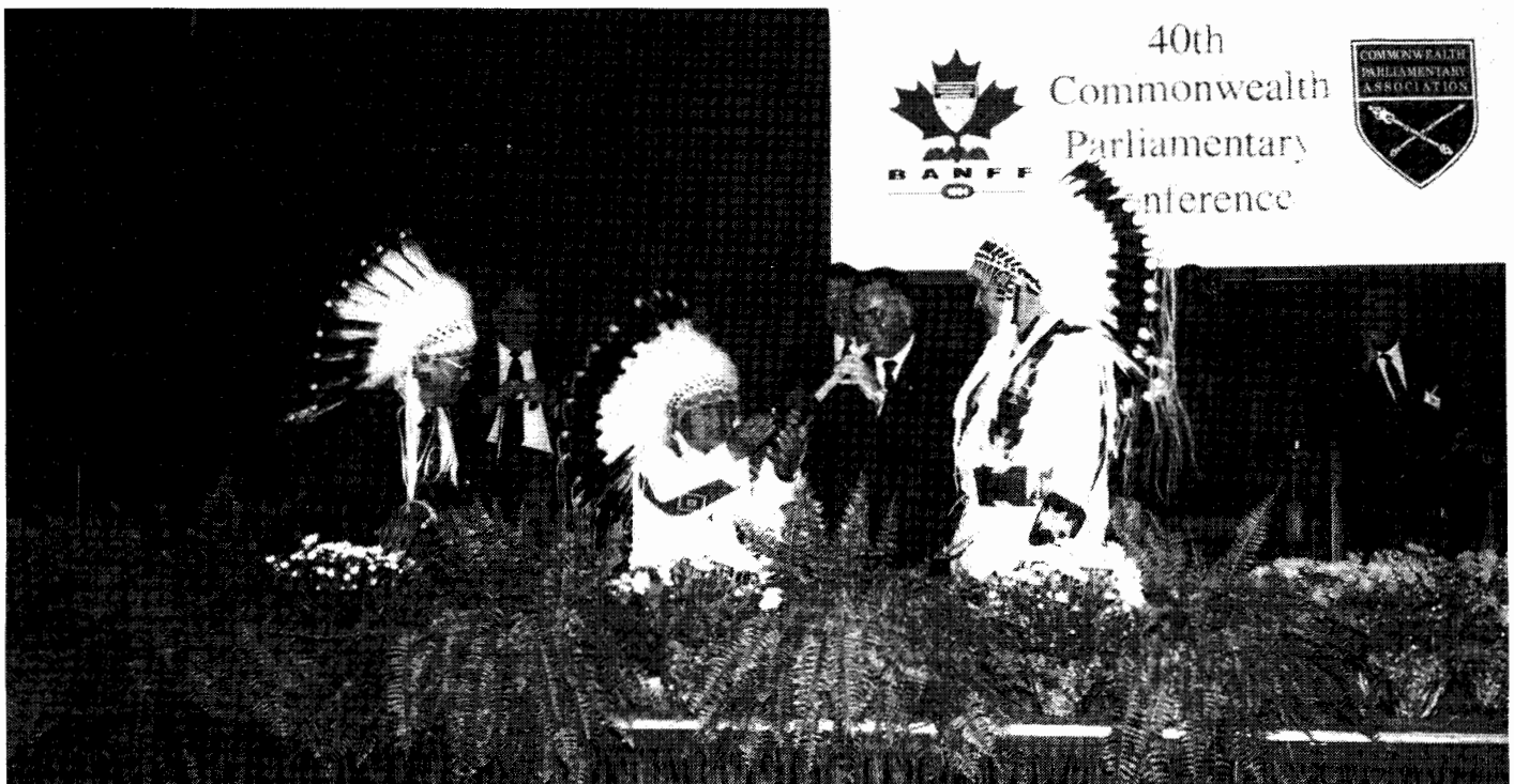
Governor General Hnatyshyn shares the traditional pipe with members of the Wesley First Nation during the Official Opening Ceremony of the 40th CPA Conference

In addition to the plenary session which dealt with how parliamentary institutions can be made more