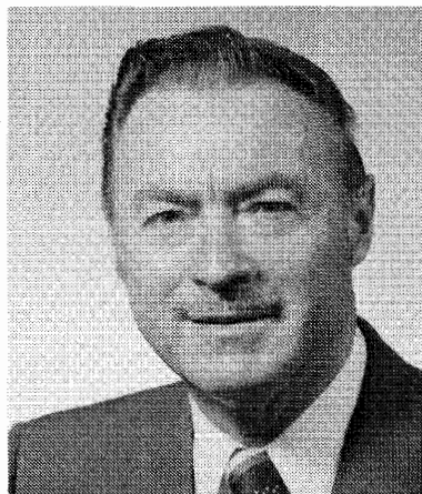
Hon. Lloyd Crouse

In February 1989 Prime Minister Brian Mulroney announced the appointment of the Hon. Lloyd R. Crouse , PC, as Lieutenant-Governor for Nova Scotia.